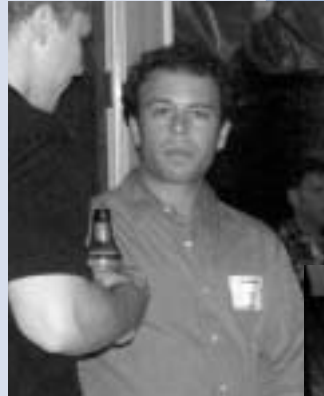
◀ "I've got to get some sleep."