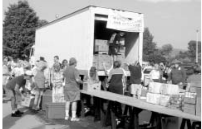
▲ Members of the WBF partnered with the Westmoreland County Food Bank to distribute food as part of “Operation Fresh Express” at Prince of Peace Lutheran Church in Latrobe.

To find out more about the Operation Fresh Express program, contact the Westmoreland County Food Bank at 724-468-8660.