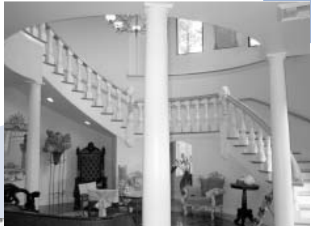
▲ The spa facilities at Lakeview Scanticon Resort and Conference Center.

Within 15 minutes of Lakeview is a rail-to-trail bike path that offers a 30-mile round-trip expedition to Arthurdale, W.Va., billed as "our nation's first