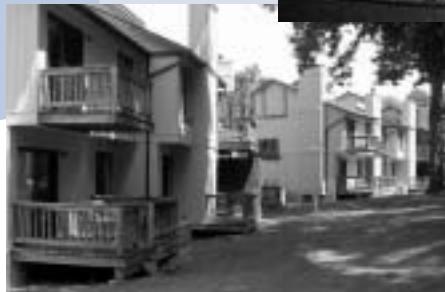
▲ Lakeview's condominium accommodations.

New Deal Homestead." This 1930s-era community is the first of three Franklin Delano Roosevelt communal projects.