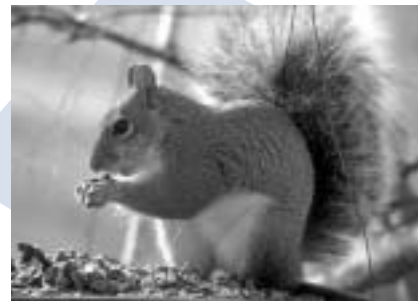
▲ Nutkin begs the Court for mercy.

But the defendant would not go down without a tussle. After an adverse ruling from the trial court, she