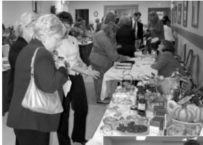
◀ Merchants donated a percentage of their profits to the WBF.

The fun-filled event showcased unique gift items from throughout the county including men's fashions,