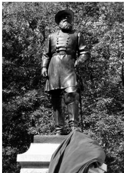
▲ A statue of John W. Geary was unveiled in Gettysburg, Pa., in November 2009.

When Geary arrived in Lecompton, the territorial capital, which today is not much more than a sparsely populated crossroad, the Free State town of Lawrence was under siege by pro-slavery elements and chaos reigned across the territory. His solution was to disband the ineffective local militia and replace it with federal troops, but a state of civil war persisted and the