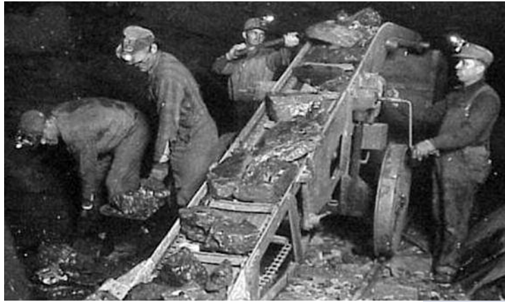
▲ Coal miners were paid around 80¢ for filling a pit car with a ton of coal while working ten hours a day for one of Westmoreland County's seven coal operators. In 1910, operators cut wages to 58¢ for every ton-and-a-half of coal that was mined.

"They [the strikers] were 'enjoined and restrained from conducting or engaging in marches past the mines, property and works of said Westmoreland Coal Company; from unlawfully assembling at and near the works of the said company for the purpose of holding meetings at such places at any time, and from assembling on the highways at any place or places where the miners of the said company ordinarily pass to and from their work, and from preventing said employees from going peaceably along said highways, and also from attempting by noise, intimidation, threats, personal violence, or by any other means to interfere with the employees of said company in