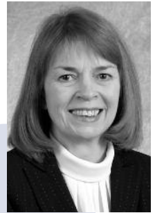
▲ Cindy Sheehan