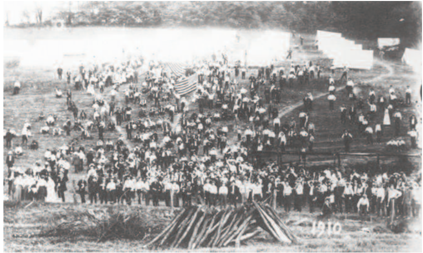
▲ On March 7, 1910, Keystone Coal and Coke Company fired 100 workers for attending a United Mine Workers of America organization meeting. Keystone miners walked off the job, and striking miners and their families were evicted from their company homes. Twenty-five tent cities sprang up to accommodate the homeless—including this one in Export where 103 tents were put to use—all financed by the UMWA.

Everyone knew he had a dangerous job, and in 1910, measures were taken to improve safety. The Bureau of Mines banned the use of black powder, compelling the use of one of several other more expensive explosives, along with the adoption of improved safety lamps. However, it was the miners, not the operators, who purchased their own explosives and lamps. At the same time, the operators